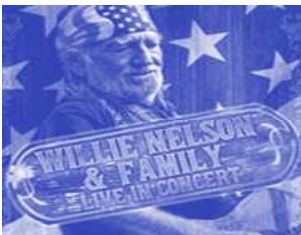
Willie Nelson & Family Live in Concert, plus Special Guest Ryan Bingham

Donation: $5 —proceeds go to Vandenberg Village Lions Club's (VVLC) administrative budget so please keep this within our Lions community